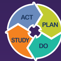
Quality Improvement Science Support

Perinatal Quality Collaboratives: Working Together to Improve Maternal Outcomes